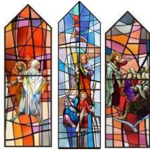
Sts. Cyril & Methodius Holy Family Sermon on the Mount Pentecost