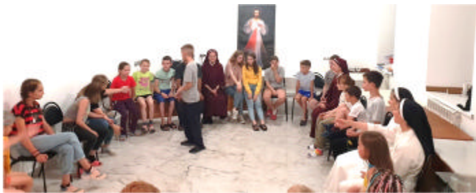
Children play a name-learning game.

room was used as the sleeping area for the boys, as renovations continue on the guest rooms on the second floor. The future chapel of St Paula, also awaiting renovation, was used as the sleeping area for the girls.