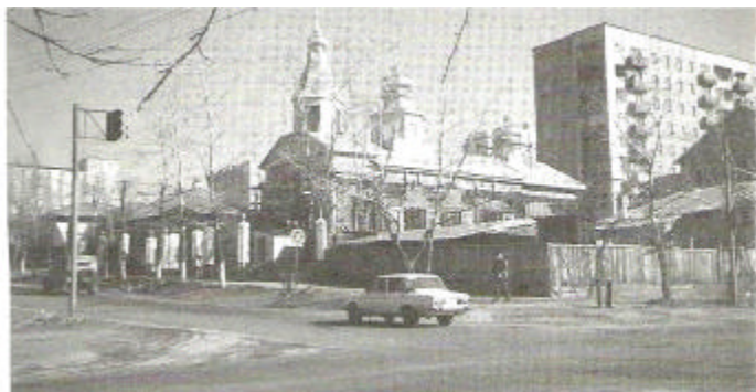
The old Ss. Peter and Paul Catholic church, built in 1898 with Orthodox roof and cupolas.