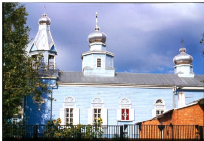
The old church with new roof and siding today