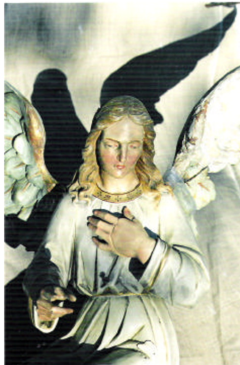
An angel from the old Chita Catholic church. The angel is in the Chita city archive.

The old Catholic church was repaired by the Orthodox, and is again an Orthodox church today. The Divine Word Missionaries now have Ss. Peter and Paul Catholic Parish in Chita.