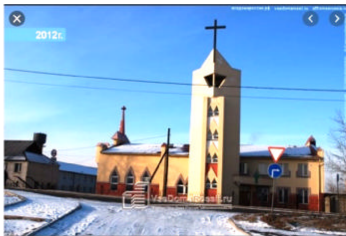
Ss. Peter and Paul Catholic Church in Chita today

Remember Mary Mother of God Mission Society in your Will.