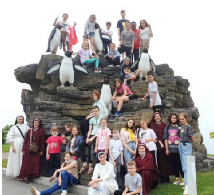
Children outside the oceanarium on Russian Island.

Remember Mary Mother of God Mission Society in your Will.