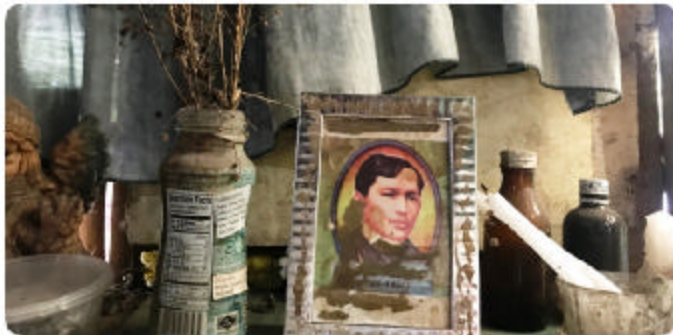
Elements of a Rizal altar

My curiosity was the driving force in my subsequent visits. In the course of my inquisitiveness, I was able to open up the topic of our own Faith, that of our Lord Jesus Christ. Of course, this dialogue with my host had argumentation here and there. Although Rizalista is a form of folk Catholicism, he did not know much about Jesus Christ, but more of our national hero Dr. Jose Rizal as divine and as sent by God. His grandchild did tell about Jesus Christ as she learned from school. This is surprising for me, since I assumed all the people here are