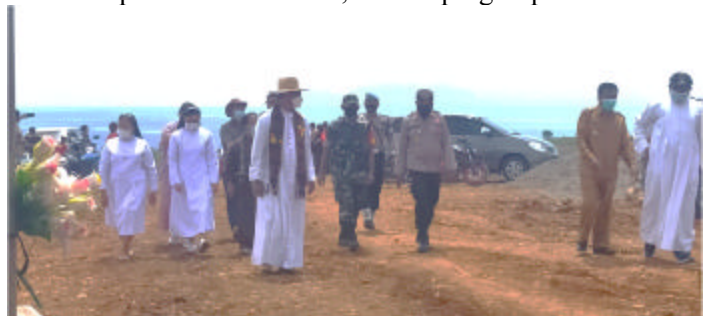
The site of the new convent, with a spectacular view of the ocean on one side and mountains in the other. The land was donated by a local parishioner.