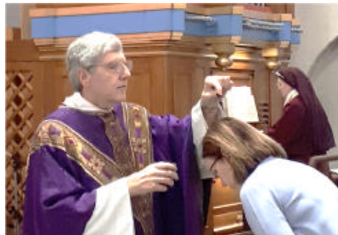
Getting ashes on Ash Wednesday