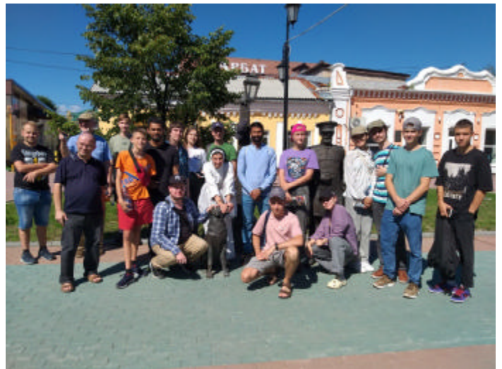
The crew gathered in downtown Ussuryrsk

The Conference is a good chance for young Catholics, who are maybe not so many in their home parishes scattered in the Russian Far East, to meet with others their age. It is a help to them to open up the beauty of Christianity and to look at the world with fresh eyes. They find something new and interesting to help them grow with God in the faith.