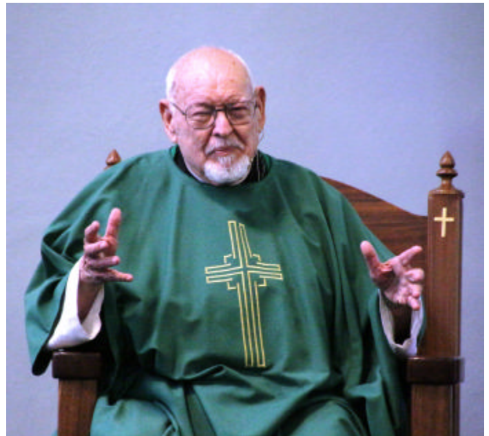
I had to preach sitting down. Too weak!