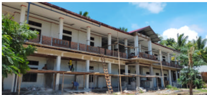
The new seminary building nearing completion

We are so happy that vocations in Indonesia continue to grow, but it also means new facilities and tuition for us. Our seminarians attend the Divine Word seminary which is located next door to our dormitories, kitchen, and chapel, and to our gardens where our seminarians work to sell produce that they themselves grow and harvest.