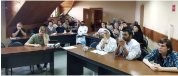
The meeting room at the parish of the Nativity of Christ