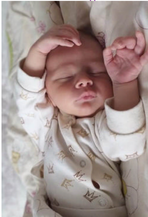
A-One, ana Two... [Yuri October 19,2021]