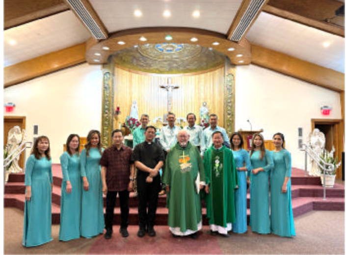
The choir that sang at the vows mass.