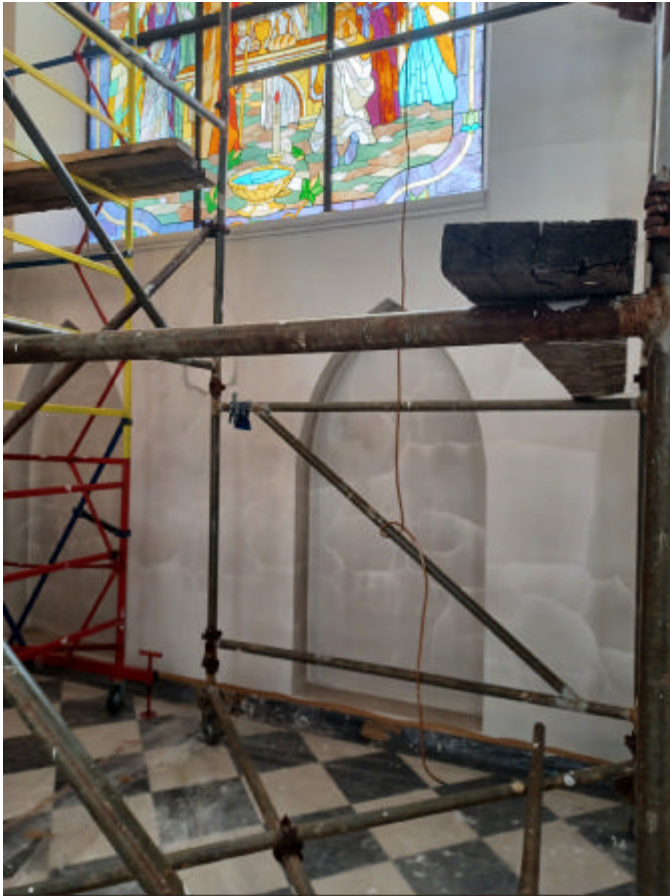
Smoke darkens the plaster and exposes the lines where the plaster breathes.