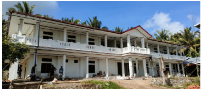
The new seminary building nearing completion

We are so happy that vocations in Indonesia continue to grow, but it also means new facilities and tuition for us. Our seminarians attend the Divine Word seminary which is located next door to our dormitories, kitchen, and chapel, and to our gardens where our seminarians work to sell produce that they themselves grow and harvest.