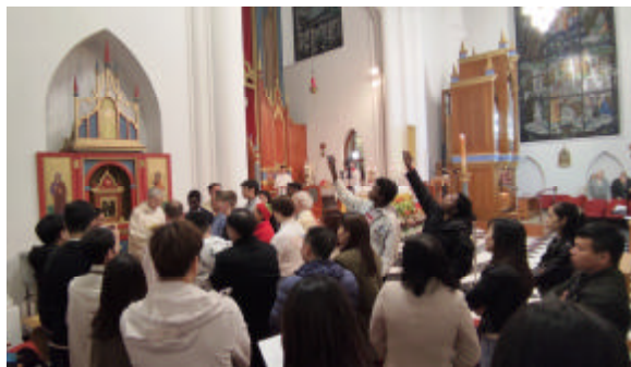
Our parish congratulates the four new baptized men. Their confirmation will be later.

● Let me give you a third wonderful bit of news. Here in Vladivostok at the Easter Vigil four adult men received the catholic faith and were baptized. My “exclamation” was “where are the women?” We’ve noted for a long time that men seem to be very comfortable in our parish – of course the women are happy about that, too.