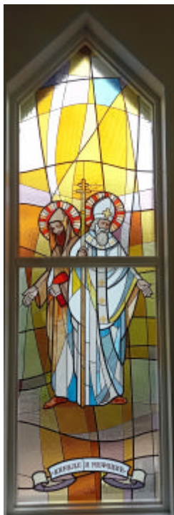
St Cyril and Methodius