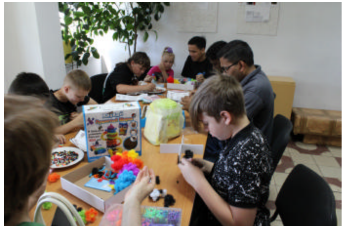
Time to be creative and have fun

Every day we had singing practice with children. During the indoor activities we made many toys from different things. With the help of plastic binders and frames we also made many designs and figures of animals. For small children there were puzzles game which they enjoyed a lot. After lunch we used to go to the playground and play different games like, football, volleyball, basketball, hula hoop, badminton etc. The children enjoyed all the games and had fun.