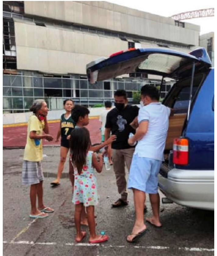
These people experience joy not just from the temporary help they receive, but also from the human connection that accompanies it.

The inspiration to start this initiative came from a personal experience. I was abandoned by my parents due to an unfortunate and tragic circumstance, and in those days