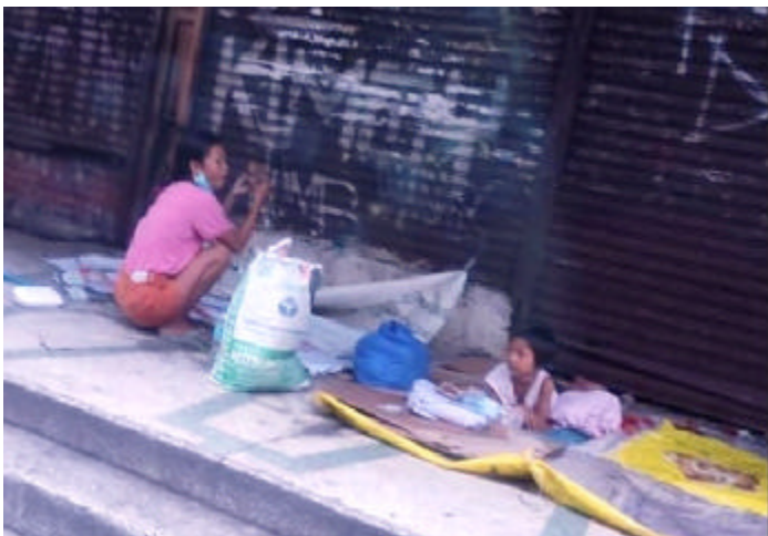
Raising a child on the street?

In the bustling city of Cebu in the Philippines, where the disparity between the rich and the poor is evident, there are many individuals who struggle to have access to basic necessities, including food. Witnessing the plight of my fellow Cebuanos , I felt a deep sense of empathy and a strong desire to make a difference. This led me to embark to be part of a mission to nourish hope by feeding those in need on the streets of Cebu.