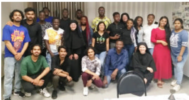
The students come from all over the world.

Both the CJD sisters and I meet these young boys and girls every Friday evening. We made a WhatsApp group. During the week, we send them an invitation and whoever wants to come, we write his/her name. When they come to the parish, we welcome them and at about 7:30 PM we start our Bible studies session with students. After the session, we eat supper and during supper we invite the students to share their three moments of the week. 1. Moment with God, 2. Good moment and 3. Bad moment. After supper we play Uno cards together. All the students enjoy the game and have fun.