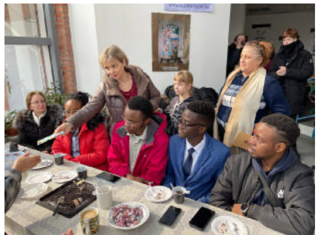
Some University students attend the Tea after Sunday Mass

As Catholic Chaplain at the Far Eastern Federal University located in Vladivostok, Primorsky Territory,