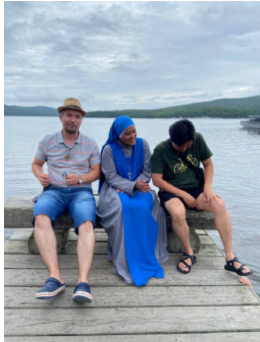
The oceanside was a good place to rest!

I would like to write a lot about each of the days spent together, but now is the time to sum up. Our joint prayer, fellowship, learning new things, should bear fruit in our Christian life. We met new friends--in heaven and on earth. Now our job is to stay connected by supporting each other. Good luck, friends! See you again at the Far Eastern Catholic Youth Conference next year!