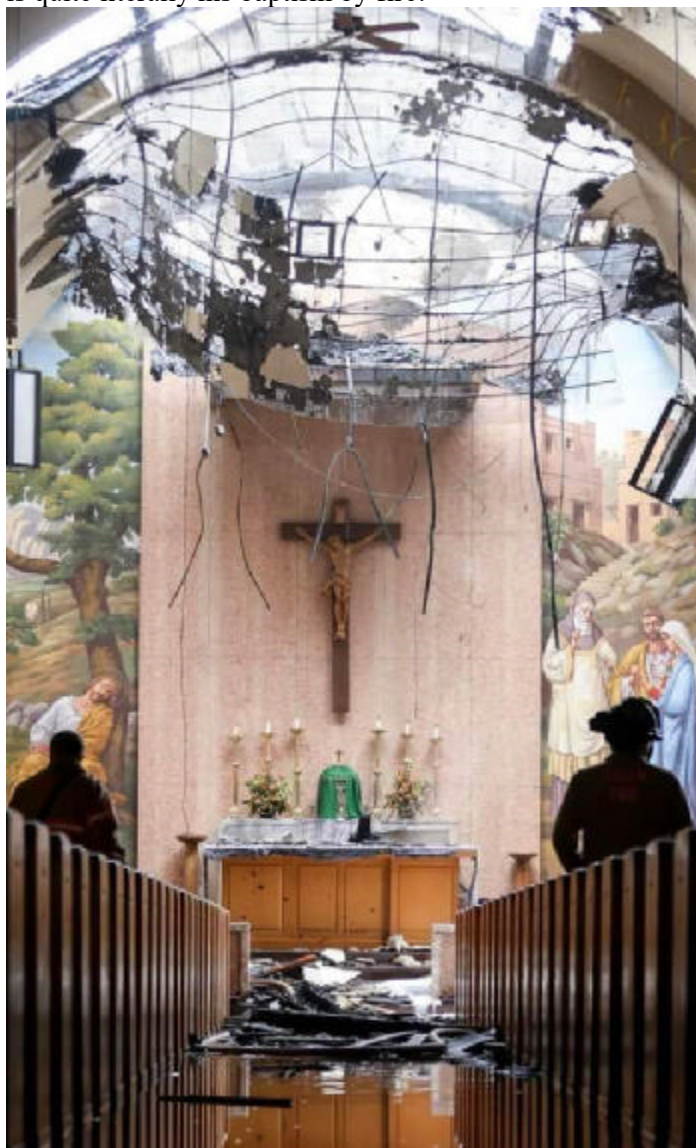
Salem's tabernacle. In Hawaii, the Catholic church was also spared.

● The church of one of our sister parishes, the beautiful St Joseph's in Salem, Oregon , was the victim of an early morning fire. Apparently, a homeless person started a fire in the dumpster alongside the church and it spread to the roof. Although the sanctuary is a loss, and the rest of the church suffered major water damage, miraculously the tabernacle and crucifix seem untouched. Please pray for our sister parish. For the new pastor of 2 months ago, this is quite literally his baptism by fire!