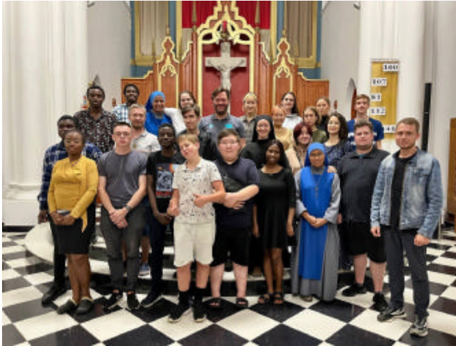
The Conference included university students from Africa.

became an expression of our great hope in God, for whom everyone is alive, who remembers every person, every breath, even if addressed to Him amidst the sometimes strange vicissitudes of human history. We were able not only to pray for the departed, but also to become involved in the hope of St. Teresa in the infinite mercy of God. In this vein, even the beauty of the Far Eastern nature and the greatness of the Pacific Ocean helped us look at the world through the eyes of the saint from Lisieux, impressed by the Providence of the Lord about every creature, large and small.