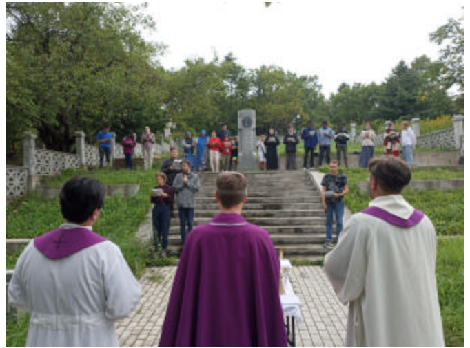
The Czech soldiers who fought during the Russian Revolution and were buried at the Sea Cemetery were probably mostly Catholics.

We devoted the first half of our day to theory. The second half was the implementation of the information received in practice. Saint Teresa, although she became a Doctor of the Church, has always been a woman of action. Therefore, under her patronage, we did not just walk around Vladivostok, getting acquainted with its history and architecture, but constantly trained in how to be open to another person. We were able to celebrate Mass at the