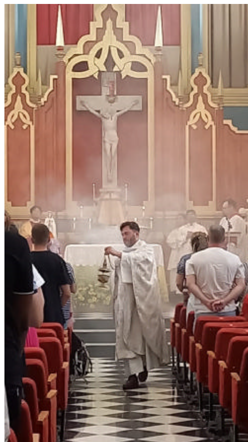
Clouds of smoke!