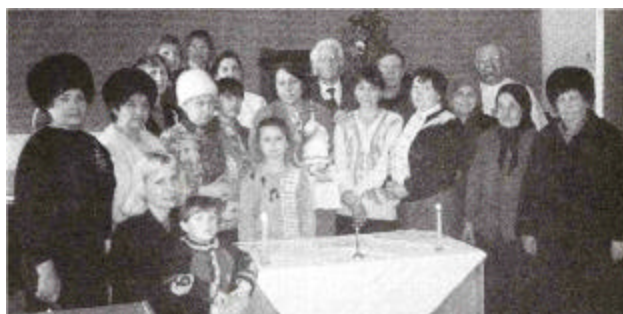
The First Mass in 1995