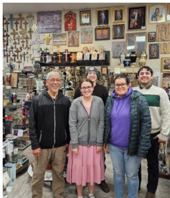
Gifts of Faith staff in Modesto, California

Gifts of Faith supports itself including wages for staff, and maintaining merchandise. It not only pays for the rent and utilities for the storefront, but also our US mission office which is located in the back offices of the store. It also pays for and supplies the merchandise we send out for conferences and parish plaza sales. All net proceeds go toward the mission and it has served as a great ongoing fundraiser.