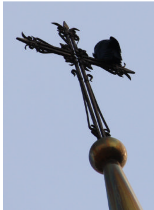
A Bird? A Balloon? A Plastic bag?

● A funny thing happened in August (or was it September—No one saw it happen!) One of the crosses from our two steeples was found on the ground! Nobody knows how it happened that such a heavy cross could jump from its high place! One theory was that it was struck by lightning, But why would lightning cause it to fall from its perch? Another theory is that the vibration of the bells shook it loose and it fell. We don’t know, but, now that the cross itself is repaired, we’ll have to remount it on the steeple. That will take either a tall, tall crane or a helicopter. Our building manager says it will take about $2,000 to fully repair the cross and remount it on the steeple. Stay tuned.