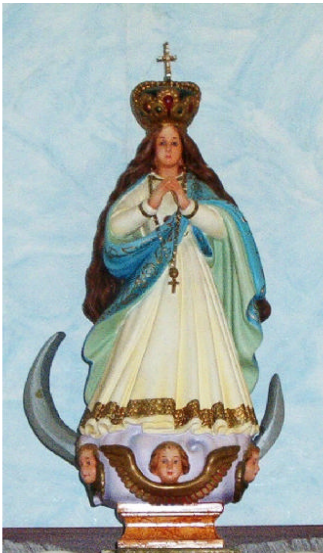
Our Lady of the Pacific, statue in the Nakhodka parish