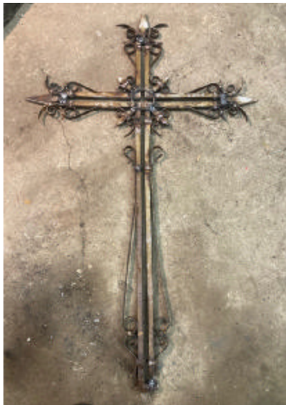
The repaired fallen “old rugged cross”

seminary education in Indonesia. Meanwhile he continues as Assistant Pastor at the Basilica of St Joseph in Karaganda, Kazakhstan.