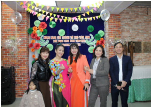
The party atmosphere is always great when the Vietnamese parishioners gather.

Vietnamese worldwide gathered at St. Peter's Square for the celebration of their canonization. Their memorial in the current General Roman Calendar is on November 24 as Saint Andrew Dung-Lac and Companions