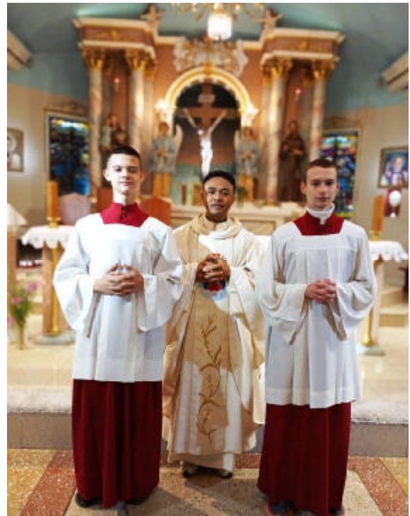
The Basilica of St Joseph was the first Catholic Church officially allowed to be built in the Soviet Union.