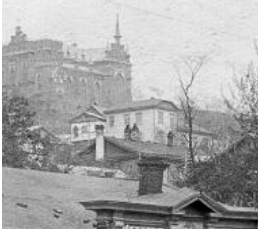
The bishop's house and chancery where the Bishop was left with one room.

report says: "Although the bishop lives in his own house, he was left with only one almost empty room where there were no signs or objects of religious worship. The appearance of the bishop was horrifying, because this respected spiritual person looked like a completely decrepit old man, dressed in civilian clothes. The bishop was frightened by this visit; he began to wave his hands and ask in a whisper that the visitor leave immediately. When the guest quietly said who he was and who sent him to find out how he could provide help, tears rolled from the bishop's eyes: "I ask you to thank the consul for his good intentions, I will pray for him and for everyone who remembers me. For my part, I will also ask only for prayer for me, because any requests for help will only worsen my already bad situation." The bishop did not say any more