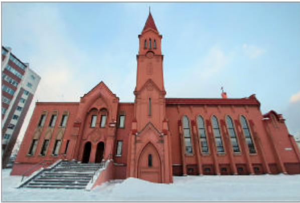
The Church of St James in Yuzhno-Sakhalinsk

of the Hours, especially Evening Prayer with us in the CJD Community. They themselves are interested in coming to the Church. I would appreciate your prayerful support, so that the Catholic Church in Russian-speaking Kazakhstan will grow and develop well.