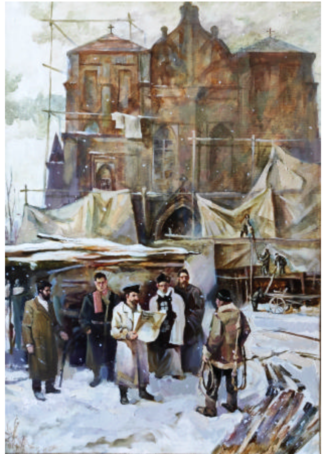
Artist's rendition of the cathedral being nearly completed but soon repression began.