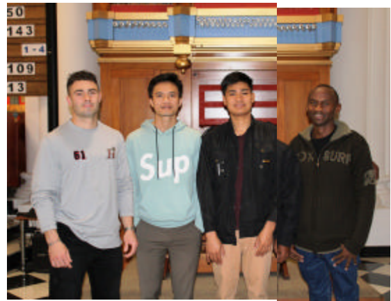
Four new novices begin a year of study with us.

● The Feast of the Immaculate Conception is the time when we Canons Regular of Jesus the Lord usually accept new novices and when novices take their first vows. This year was no exception. At evening prayer on December 7 four men were admitted to our novitiate after being with us a month already. Here is a picture, but we usually don't mention names until later. This year's novices are from the Philippines, Uganda, Canada, and Vietnam. They are all interested in becoming priests for Russia, and