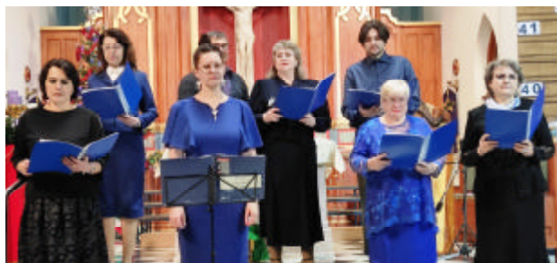
The Presbyterian Choir

• Giving Day for Mary Mother of God Mission Society is on March 25, the Feast of the Anunciation when the Blessed Virgin Mary became the Mother of God. This year the feast will actually be on the 25 th , as Easter is so late in April. Our goal this year is for funding to build a small church for Holy Trinity Parish in Romanovka, Russian Federation. For 30 years already the parish has had its chapel and offices in an apartment. But now the Russian government has a law restricting group religious services from being in buildings designated as "residential". Years ago already the parish purchased land to build a church, so we have that already. The land is in the center of the village. So now we want to build a church there—Not a big fancy church, but something more suitable to the parish. Hopefully it will be a church with an attached social space for meetings and tea/coffee after mass and for celebrations like baptisms and marriages. Maybe an outbuilding for the mowing machine and snow removal equipment. We aren't sure yet of the sum needed, since planning is still underway, but our goal for Giving Day is $60,000.. Meanwhile, the present apartment can be used for the priest, or for sisters, or for a maintenance person. Although Romanovka is a village, nearby are the cities of Balshoi Kamen and Fokina where Catholics live who also belong to Holy Trinity Parish. Mark your donation "Giving Day"! Thank you!