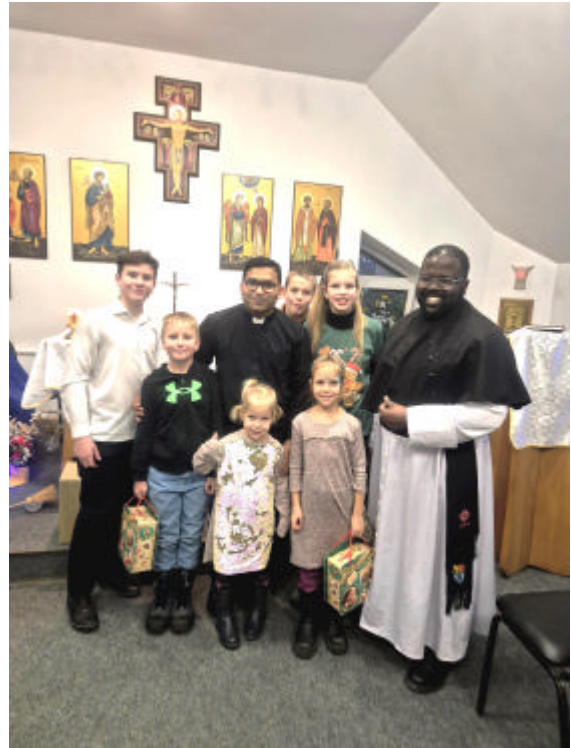
Christmas kids at Annunciation Parish, Arsenyev

The Orthodox Church celebrates Christmas in January. Maybe our attendance was better because of the war??