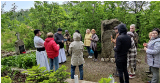
Parishioners at the site in 2024

Unfortunately, the Memorial to the Repressed is not an object of cultural heritage and is not in the municipal property of the Vladivostok urban district. The pilgrims